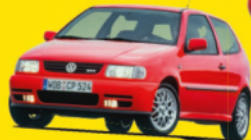
VW Polo GTI