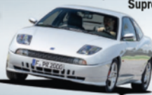
Fiat Coupé 20V Turbo