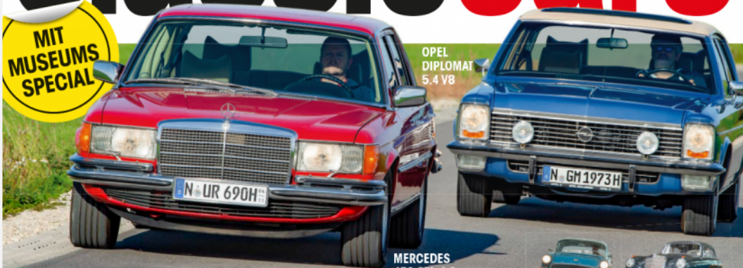
OPEL DIPLOMAT 5.4 V8